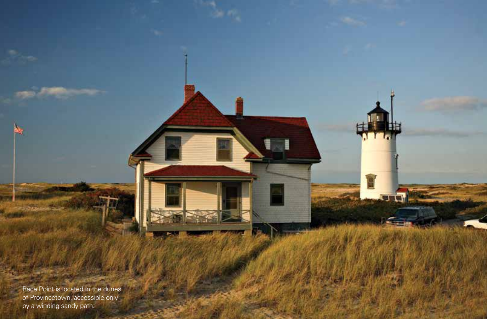
Race Point is located in the dunes of Provincetown, accessible only by a winding sandy path.

Nauset, Three Sisters, Chatham, Highland (Cape Cod) Light, and Nobska.