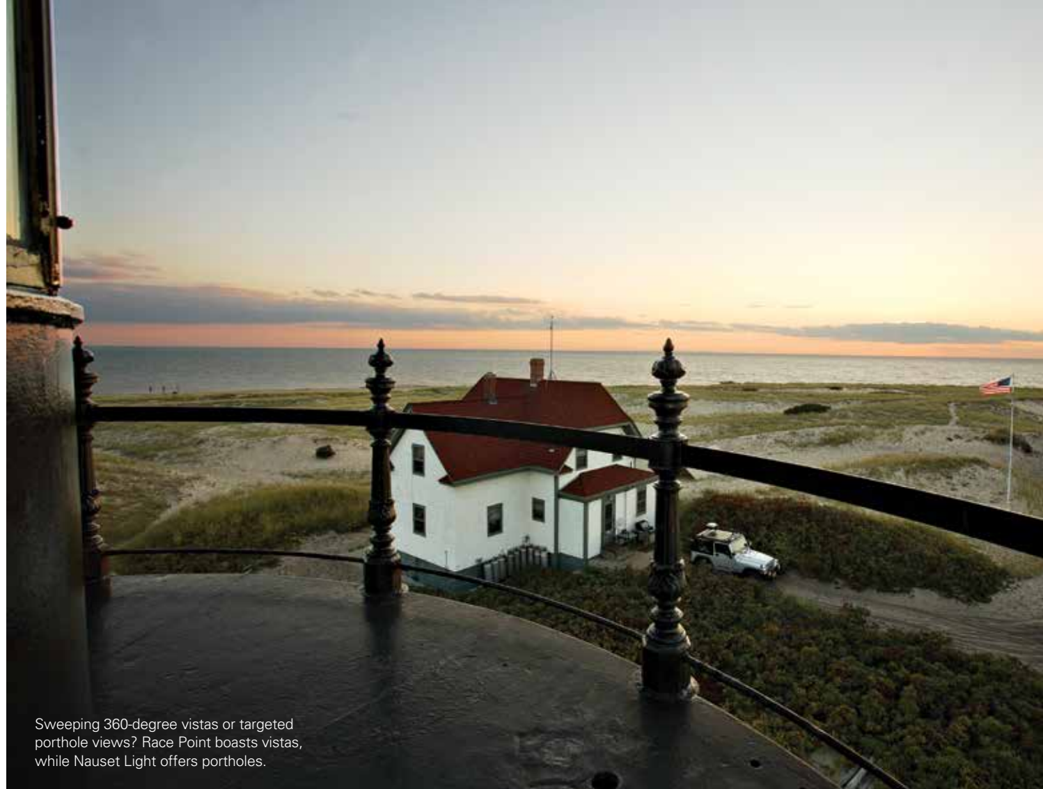
Sweeping 360-degree vistas or targeted porthole views? Race Point boasts vistas, while Nauset Light offers portholes.

Even though his job is unique, we can't ever seem to get away from it—even on our honeymoon. While driving Ireland's Ring of Kerry 15 years ago, we stopped in Kinsale, a coastal village in County Cork. Spotting the 17th century Old Head of Kinsale, famous for being the closest land point to the sinking of the RMS Lusitania in 1915, we made our way over, only to find out it was roped off for reconstruction. "He is a lighthouse inspector from Boston," I boasted to two construction workers. Next thing we knew, the rope was lifted and the four of us walked up the stairs, the three men swapping technical construction stories.