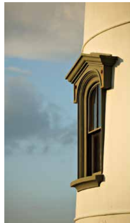
Architectural framing around a tower's windows is an important description to note.

The tour began late June with a family reunion (mine) at the Lighthouse Inn in West Dennis, followed one week later with an overnight stay in Provincetown, then various day trips through the summer and fall with friends to