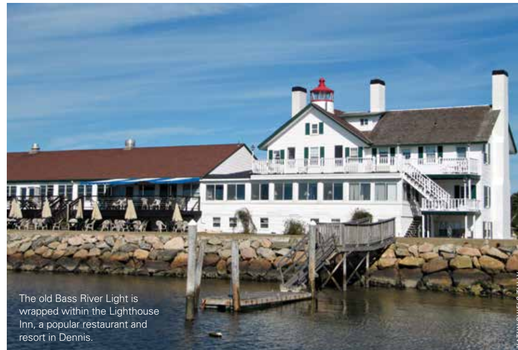
The old Bass River Light is wrapped within the Lighthouse Inn, a popular restaurant and resort in Dennis.